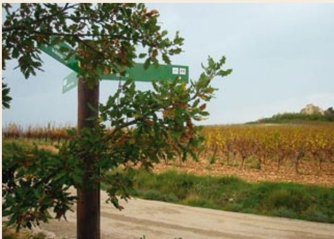
Coll de Montagut. In the background, cal Rovira

Vineyards. We come to a land where the vines are trained over frames which appear as if they want to block our way. We have to follow car tracks towards the northeast and make a de-