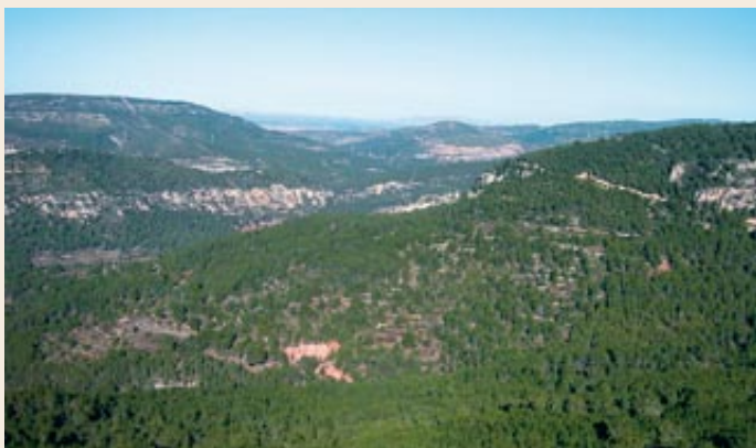
The Gaià valley

Chain. At the sides of the track we come across two green coloured iron posts which support a chain. Despite the fact that it is almost never closed, for those on bikes, it might be well to take