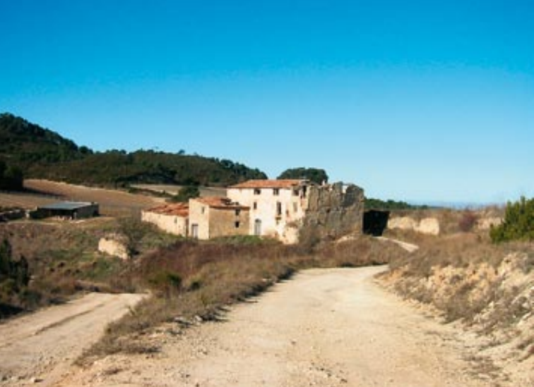
Masia de cal Boada