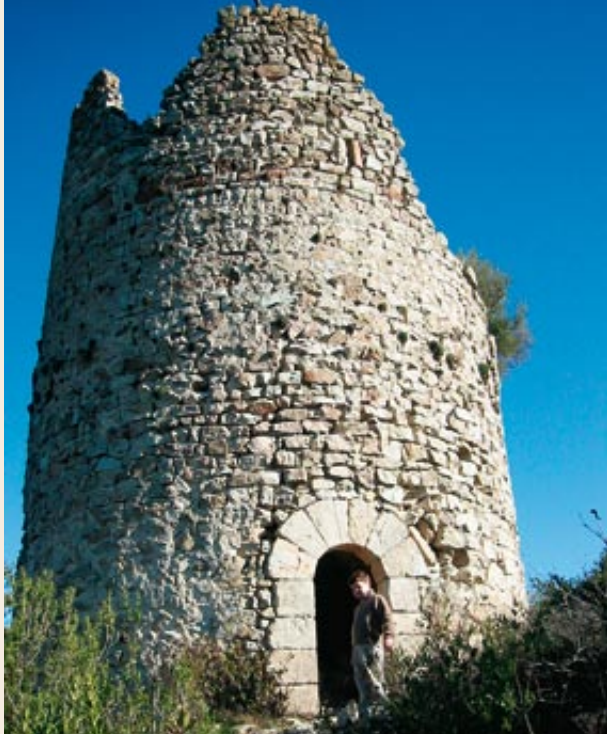
Tower with lintelled door