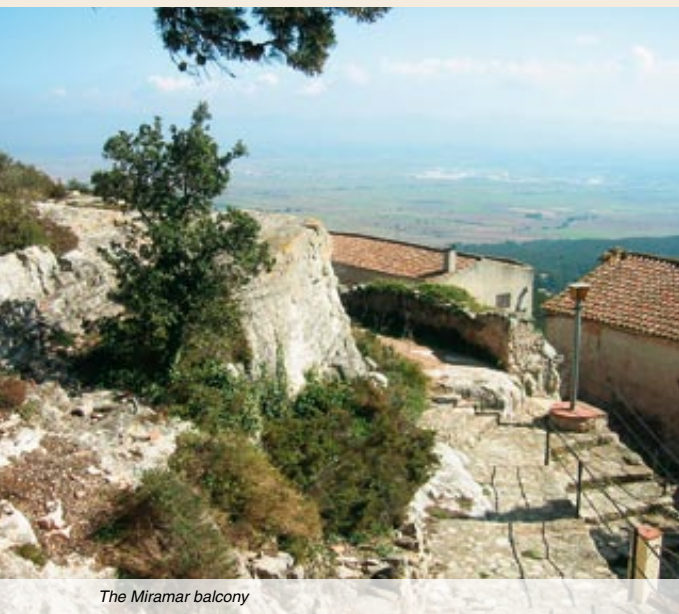
The Miramar balcony

We enter by the main street or Carrer Mayor. At the third set of large gates we come to the Xalet-Refugi Montserrat Gili, the refuge, owned by the Secció de Muntanya de l'AAEET de Valls. To make use of the refuge, the keys must be requested beforehand from the association's headquarters in Valls. The street consists of the house façades and the crag leading up to the Plaça Mayor or the main square. From here, we can make our way up to the church and take great delight in the impressive panoramic views from the "balconada de Miramar" in front of the church.