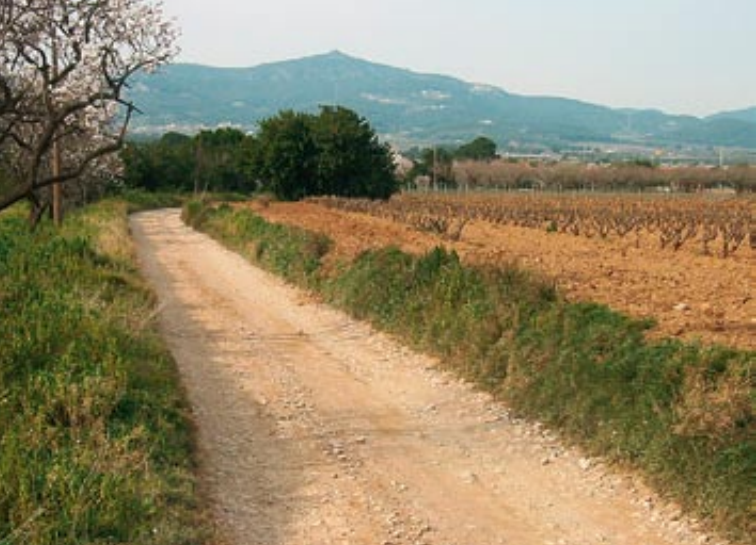
Camí de la Verneda