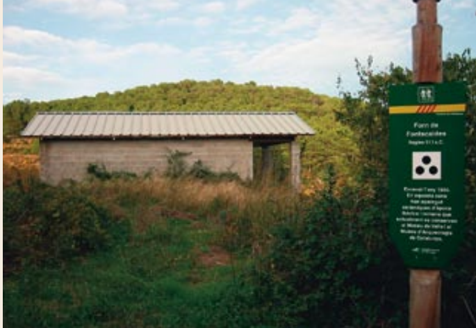
Protective shelter for the Forn Ibèric or Iberian furnace