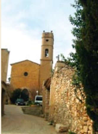
Església de Masmolets