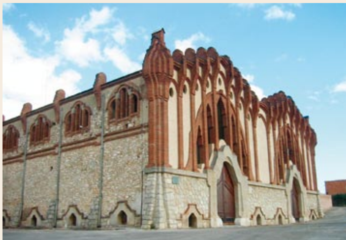
The modernist Celler de Nulles

Cooperativa de Nulles. We come to the back of this wine-making cooperative's modernist building. We continue to make our way by taking the road to the centre of this town, and the end of our hike.