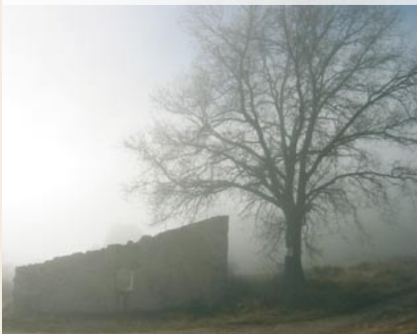
Cases Noves de Formigosa