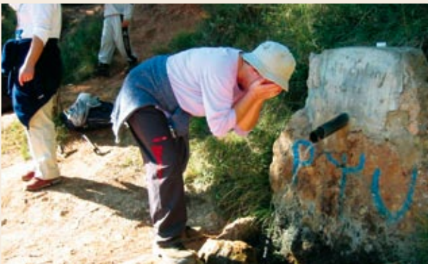
Font del Jovany

Coll del Pinar de la Costa (900m). A hundred metres before we will have left a little used path on our left hand side. In the middle of the hill we now come to where two paths intersect and we take the one to the left, which, towards the north, begins