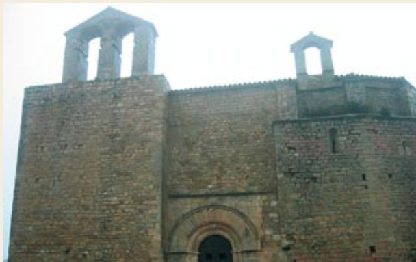
Sant Jaume de Montagut church façade

Esplanade. Various tracks leave from this point, basically intended for fire prevention purposes. We take the one which is by far the widest and most frequently used, following the wide mountain ridge through the not very dense forest.